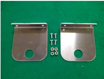
(Parts Required for Step 1)

(Step 1) – Assemble bar holders to tray on work station (Nuts to outside of tray) (see Example 1)